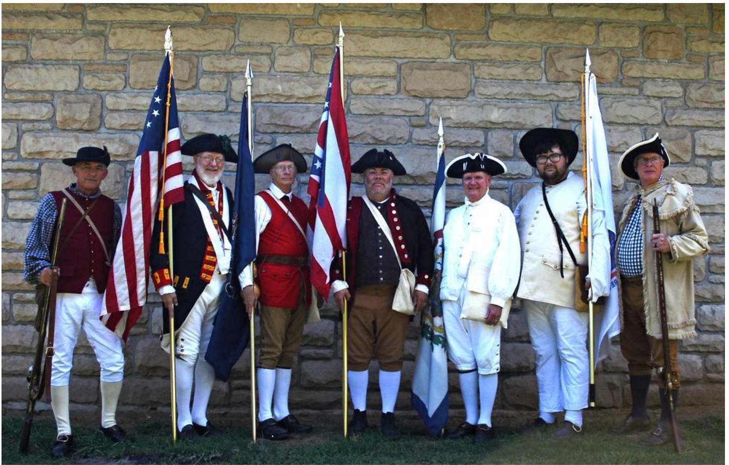
Combined Colorguard of the Ebenezer Zane Chapter OHSSAR, Fort Henry Chapter WVSSAR, and the George Washington Chapter, PASSAR.

From the President Continued on next page.