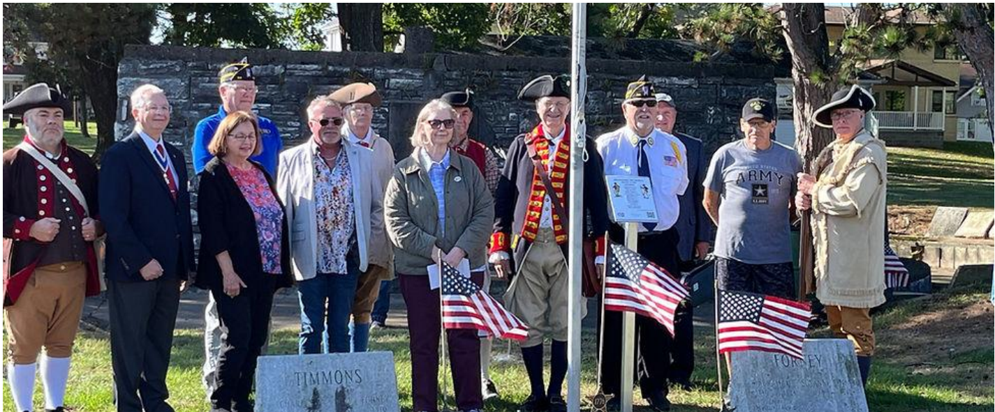
Invited Dignitaries, Contributors to the Harrison County Cemetery Marker Project and Members of Ebenezer Zane Chapter, OHSSAR.

Then, in October, we held a sign dedication ceremony at the Old Cadiz Cemetery (our first in Harrison County) which also was attended by dignitaries and contributors to the project.