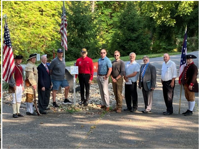
Contributors to the Jefferson County Cemetery Marker Project unveil the sign at Union Cemetery