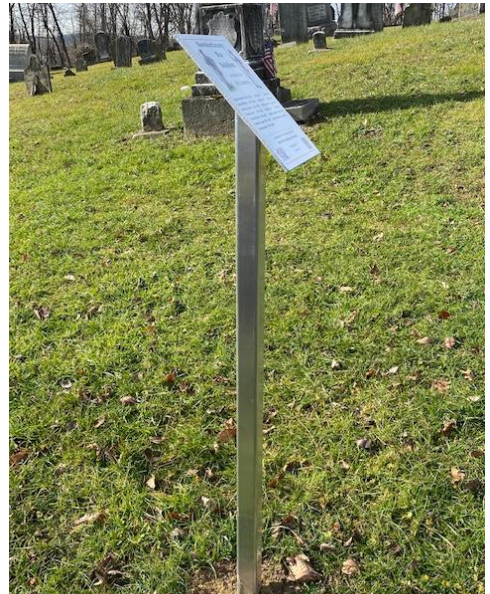
Example of aluminum sign located Stone Church Cemetery in Wheeling WV.

Finally the Chair of the Audit Committee presented the members with a proposed amendment to our Bylaws. This amendment is basically a “house-keeping” amendment that refines the audit procedure. It specifies the current authorized account signers be identified. The amendment reformats Appendix D “Financial Audit Report” to include more space to list deficiencies and add space for the committee to sign the report. It also further describes the duties of the Treasurer to include drafting a proposed budget for the next year to be considered at the Board of Management meeting in November. Once the budget is approved the Treasurer is free to pay line item expenses as they ore incurred. After discussion of the amendment it was decided to table it and vote on it at the next meeting.